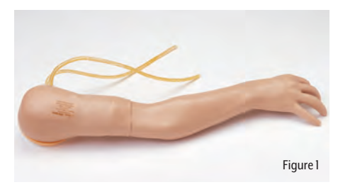
A. Detach the arm from your CPR manikin by rotating the arm upward so the hand is above the head of the manikin. Pull arm away from the body of the manikin. (See figure 1)