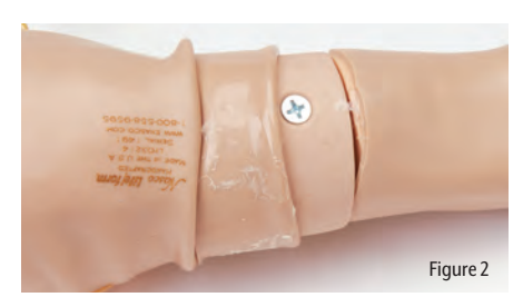
B. Roll shoulder skin up to expose the screwhead located below the deltoid intramuscular injection site. Unscrew and remove this locking screw. (See figure 2) Rotate the lower arm outward until it stops.