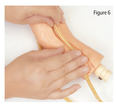
G. Double the tubing to find the approximate center, and place in the grooves of the lower core starting with the center of the tubing at the center of the back of the hand. (See figure 6)