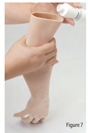
H. Generously coat arm cores, tubing, and inside of skins with liquid lubricant. (See figure 7)